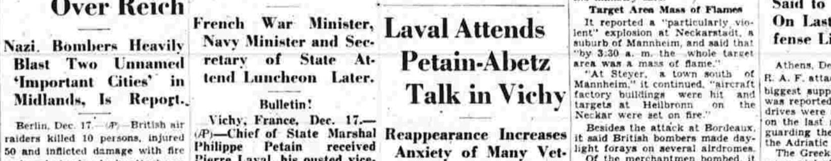
Pétain and Abetz Talk On Future of France. French War Minister, Navy Minister and Secretary of State Attend Luncheon Later.