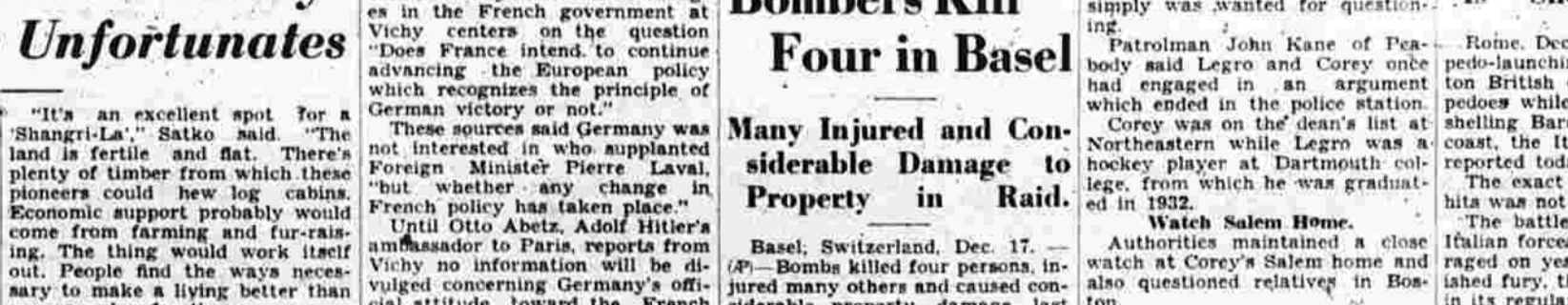
Germany Not Concerned With Successor of Laval in Foreign Post. Nazi Interest Only in Policy.